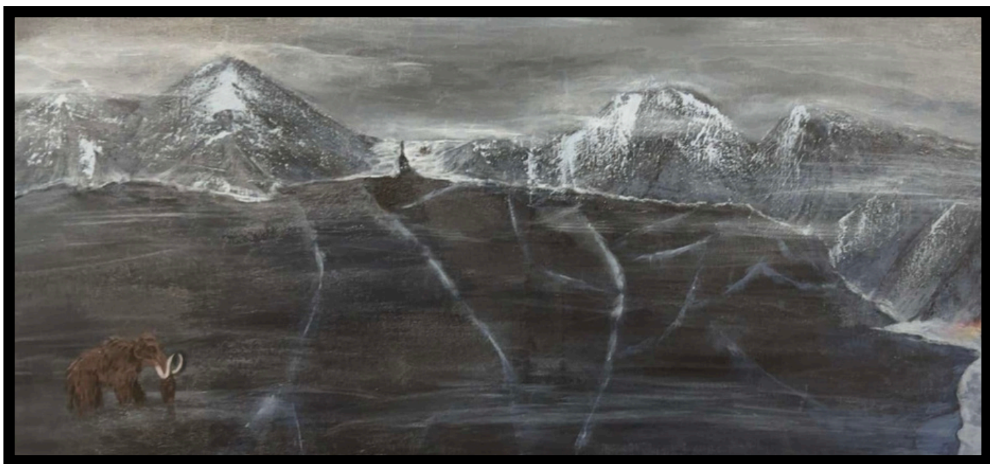
Pleistocene Epoch acrylic painting on 10x15 inch canvas